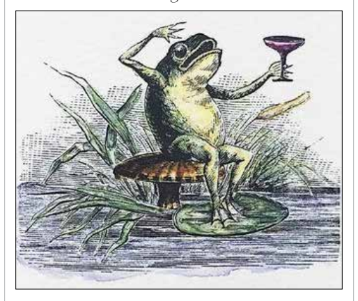
Pub Club's logo in the 1970s

This informal history of the Pub Club has no attribution. It does, however, have the ring of authenticity.